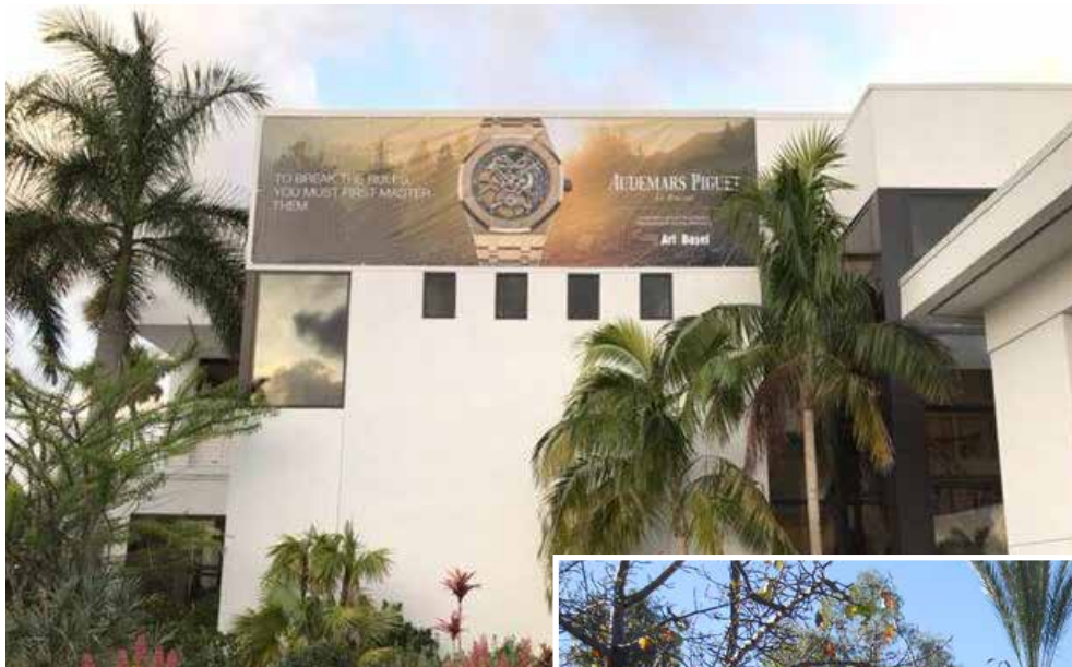
ORION JET CENTER MIAMI-OPA-LOCKA EXECUTIVE AIRPORT