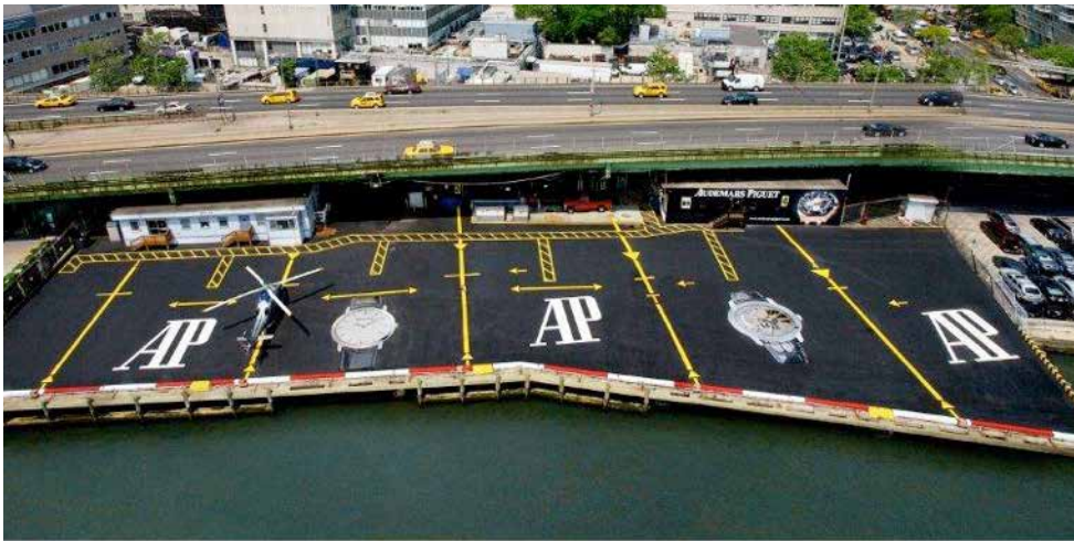
34TH STREET HELIPORT, NEW YORK