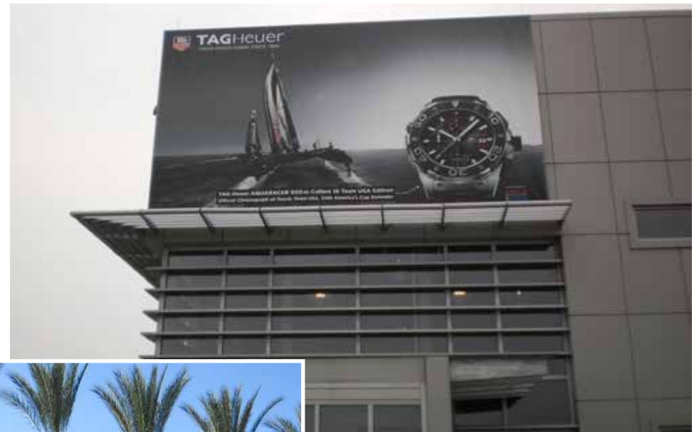
PROVIDENCE JET CENTER QUONSET STATE AIRPORT