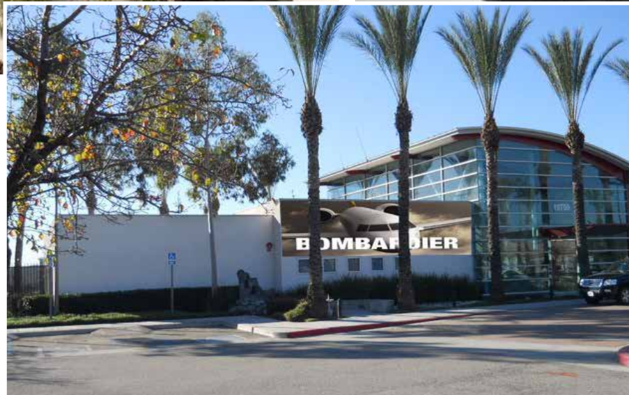
ATLANTIC AVIATION BOB HOPE AIRPORT (BURBANK, CA)